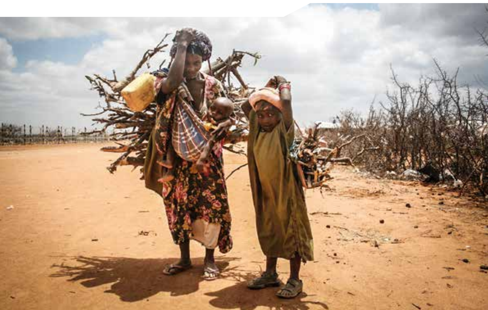
A mother and daughter collecting firewood in Dadaab refugee camp. UNHCR Chief António Guterres has acknowledged the role environmental factors played in exacerbating refugee crises in the Horn of Africa.

“ EJF believes that refugee law is not a suitable avenue through which to pursue responses to climate-induced displacement. It is vital that existing instruments are not amended or opened up to renegotiation. ”