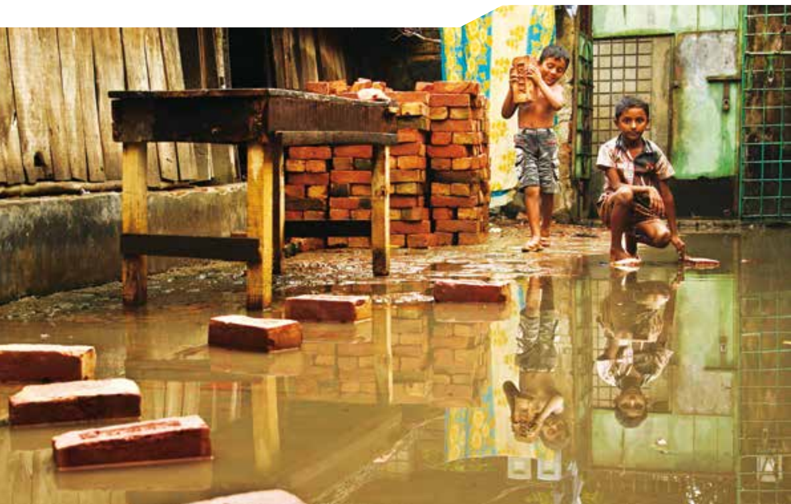
The right to a safe and healthy environment is a basic right upon which other human rights depend. Here, children make a bridge across a flooded slum in Khulna.

“EJF argues that current international human rights standards are of limited utility to situations of climate-induced displacement in that they fail to explicitly govern the issue and neither inform policy nor offer sufficiently strong grounds upon which to pursue litigation.”