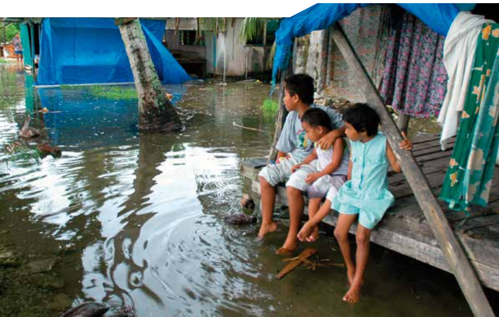
Children watch as king tides inundate their village in Tuvalu. Freshwater scarcity threatens to fundamentally undermine some small island states long before their islands are submerged by rising seas.