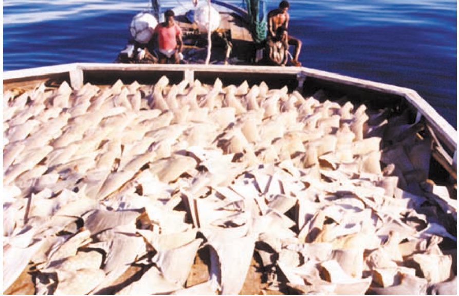
ABOVE: Illegal shark fin catch. Efforts to sustainably manage fisheries are severely undermined by IUU fishing.