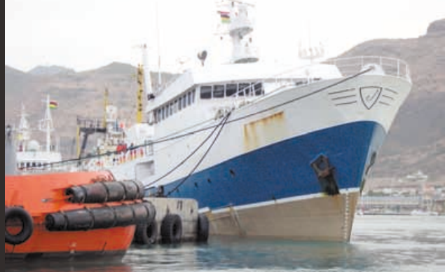
ABOVE: The Inca (now Condor) in Port Louis, Mauritius, in September 2004.

In 2001/2, renamed Viking and flagged to the Seychelles, the vessel unloaded toothfish in Port Louis, Mauritius. The Seychelles