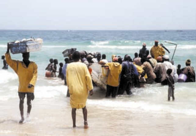
ABOVE: IUU operators use unfair competition and make the most of other people's poverty.