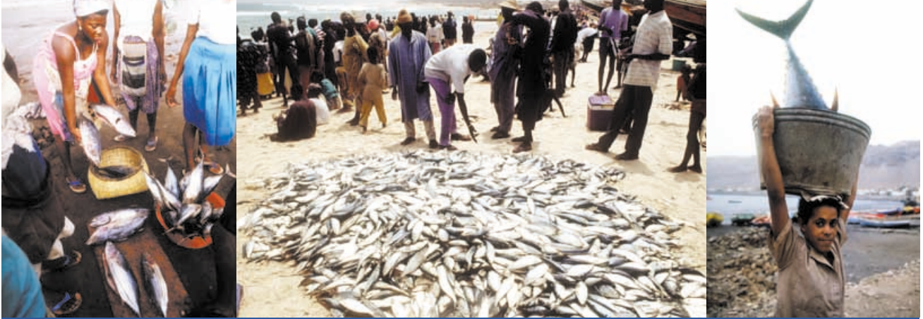
ABOVE: West African waters are plagued by illegal fishing vessels that deplete local fish stocks, ruining livelihoods and jeopardising food security in the region.