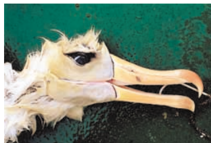
ABOVE: Tens of thousands of endangered albatrosses are killed each year by illegal long-line vessels in the Southern Ocean.

However, several near-term, cost-effective and “real-world” solutions are available to the international community. For example, closing the loophole in international law that allows States to issue Flags of Convenience would be the single most effective step in eradicating IUU fishing 10,19 – what is needed now is determined international political leadership to turn these opportunities into action.