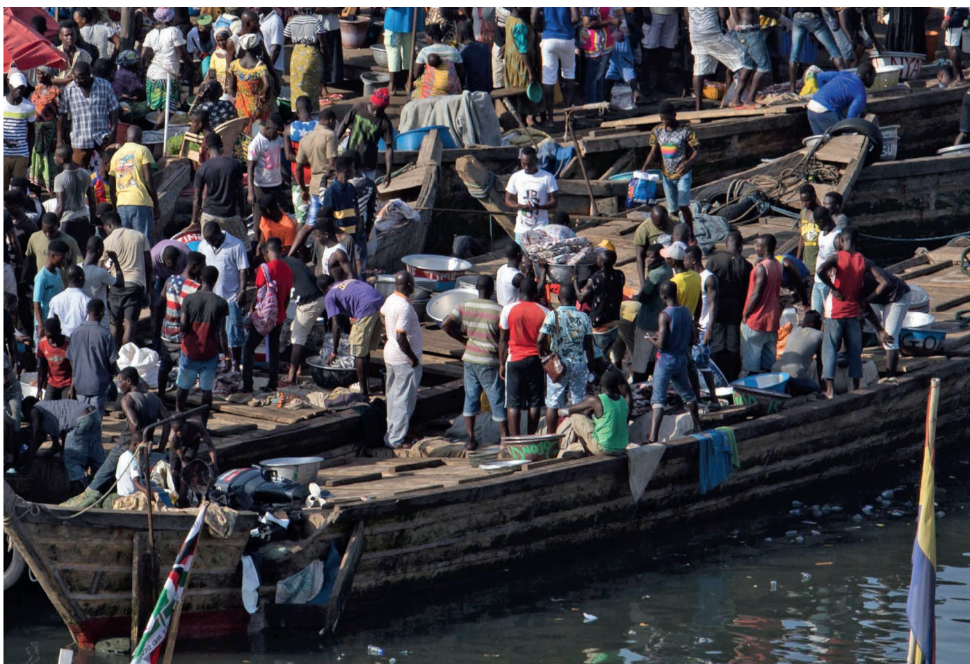
Despite being illegal, a low risk of arrest and sanction has meant that saiko landings have taken place in full view of authorities.