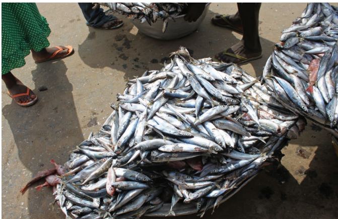
An average saiko trip lands 26 tonnes of fish.