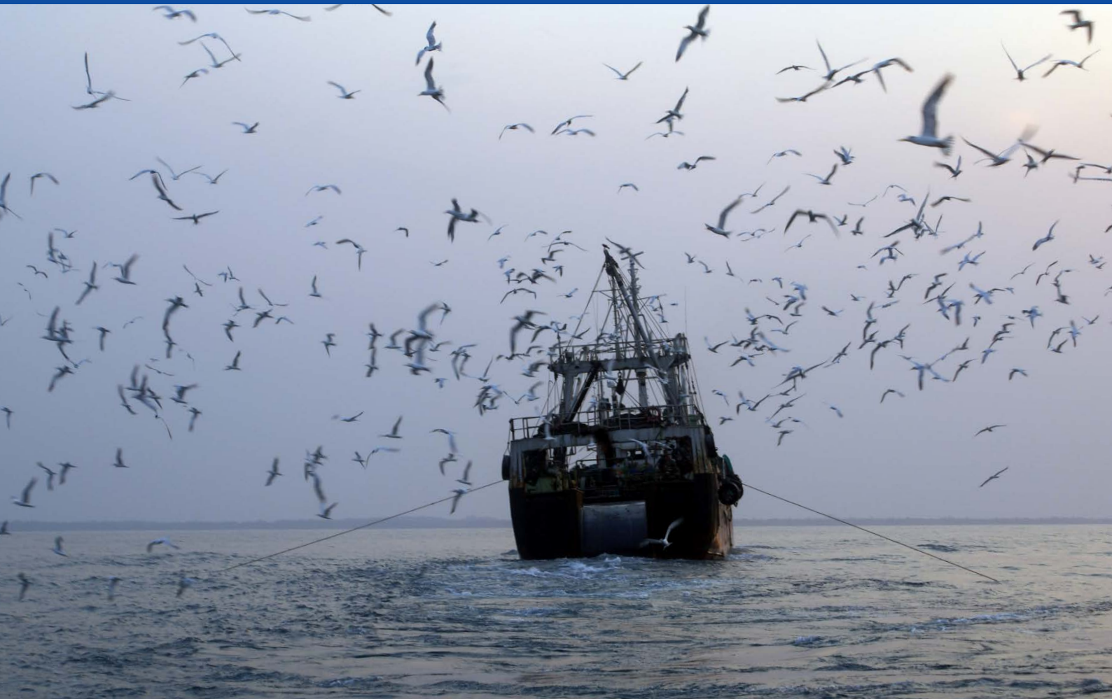
Saiko accrues profits to a handful of owners of industrial trawlers and saiko canoes, to the detriment of millions across Ghana's coastline. In 2017, around 80 industrial trawlers were licensed to fish in Ghana's waters.

The Environmental Justice Foundation (EJF) and Hen Mpoano are working in partnership under the Far Dwuma Nkodo – "Securing Sustainable Fisheries" project, with financial support from the European Union and the German Federal Ministry for Economic Cooperation and Development (BMZ) . The Far Dwuma Nkodo project is a three-year project to secure greater environmental sustainability and social equity in Ghana's fishery sector.