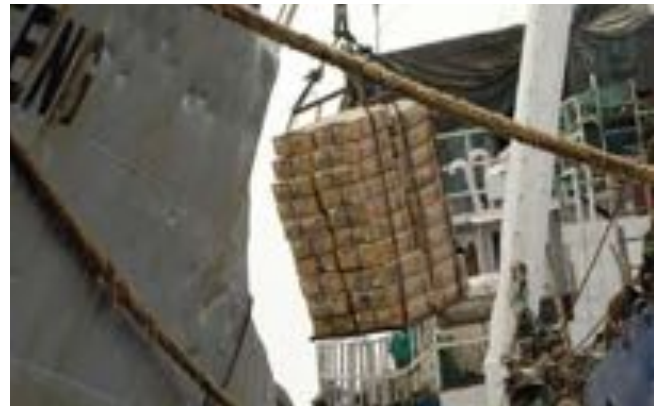
Bottom: Frigoluz – one of the largest fish processing companies in Europe – receiving CNFC fish.