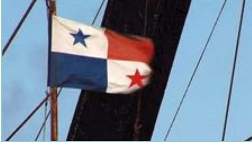
Flags of Convenience, like that of Panama, provide perfect cover for IUU fishing activities.