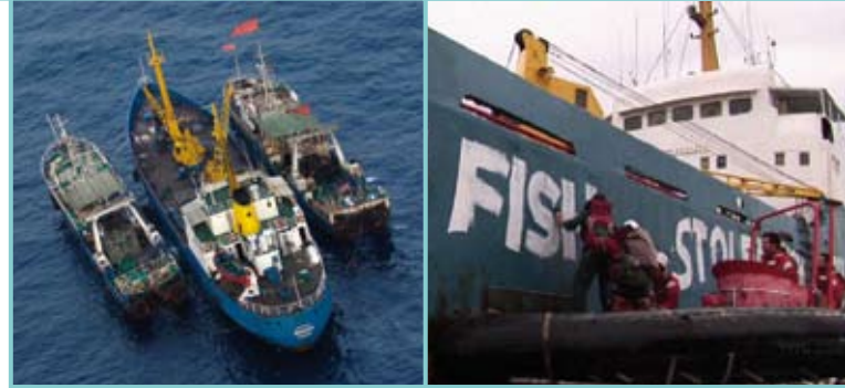
Left: The Binar 4, illegally transshipping fish off the coast of Guinea Right: Fleeing from Guinean waters towards Las Palmas with its illicit cargo, the Binar 4 is branded a pirate. EJF/Greenpeace findings were forwarded onto the Las Palmas fishing authorities.

The Port Authority records show that the Elpis has been a regular visitor to Las Palmas, making 18 stops since January 2003 64 .