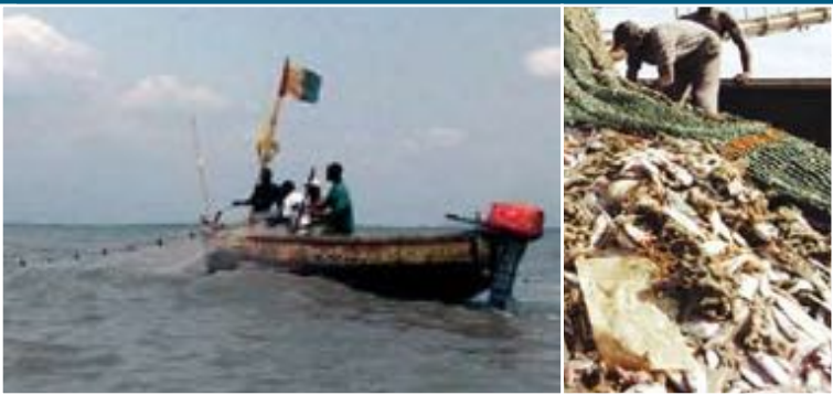
Top left: Marine fishing provides 70,000 direct and indirect jobs in Guinea. Yet Guinea is estimated to be losing $110 million every year to IUU fishing, posing a serious threat to a population dependent on fish stocks for food and livelihoods.