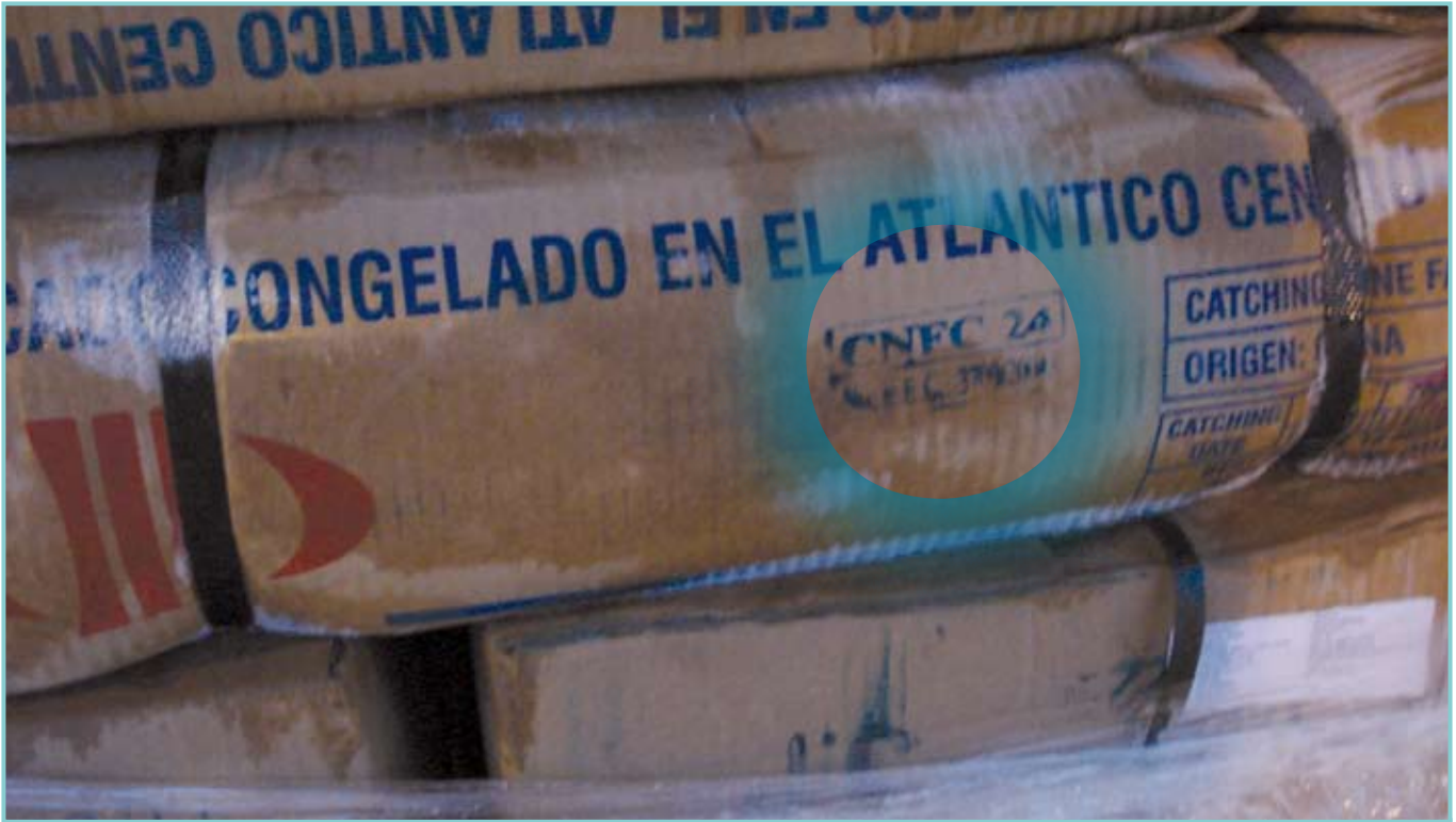
Above: Boxes of possible IUU fish for sale in Billingsgate Market. Despite being labelled as "Origen: China", examination of the FAO Catch Area shows they were caught off West Africa. Unusually, the name of the catch vessel is clearly legible: CNFC 24 – observed in Guinea in 2006 illegally transshipping fish at sea.