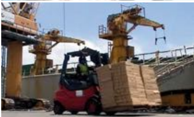
Top: Fish being unloaded in Las Palmas