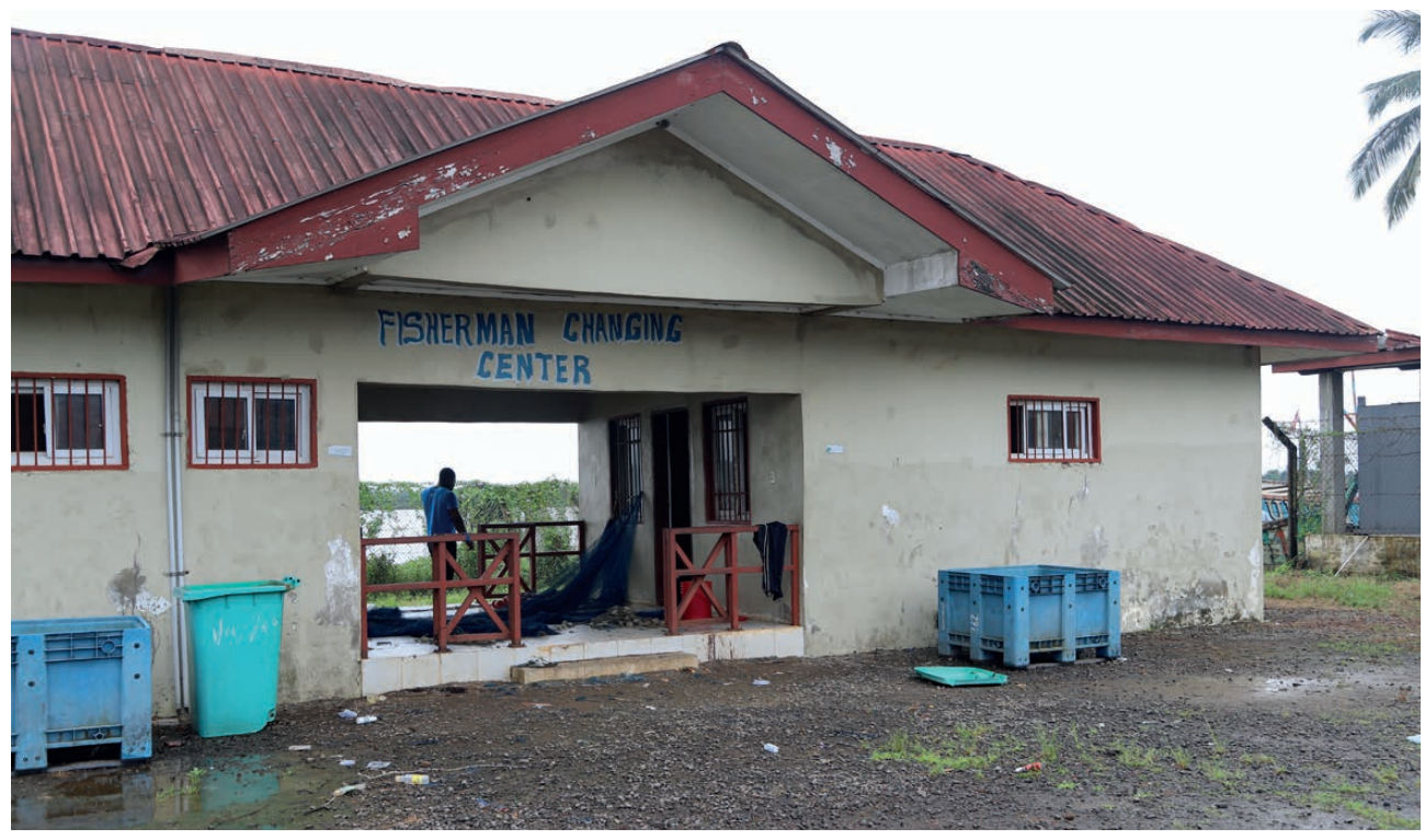
Fishermen changing centre at the Robertsport Fish Landing Cluster