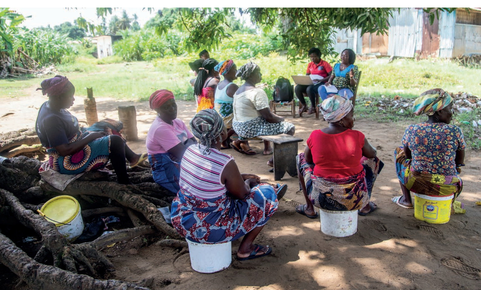
Fishmongers and processors in a meeting on the beach