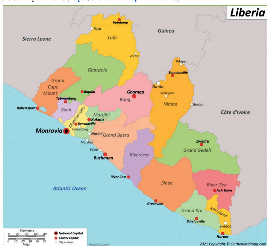
Figure 1: Political map of Liberia (https://ontheworldmap.com/liberia/)

fisheries, artisanal inland fisheries, and aquaculture, which is still in its infancy. Foreigners dominate the industrial and marine fisheries, <sup>26</sup> and locals dominate the inland fishing, mainly undertaken on the country's six major rivers and two lakes. <sup>27</sup>