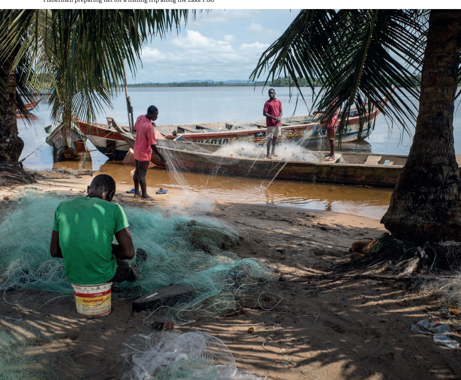
Fishermen preparing net for a fishing trip along the Lake Piso

Additionally, mediating institutions with plans to establish and promote CMAs in Liberia should ensure that the central government and local communities' commitments to the CMA process are grounded in the objective of promoting sustainable fisheries management, and not on the financial or developmental benefits they receive from these institutions.