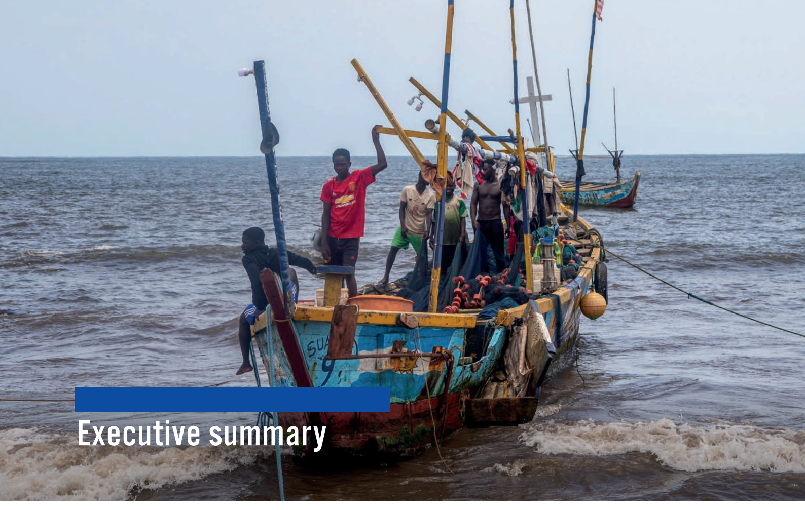
Fishermen leaving for a fishing trip in Robertsport

The Government of Liberia was solely responsible for the management of small-scale fisheries until 2012, when the country adopted collaborative management as an alternative fisheries management practice. To implement collaborative management, Liberia established the Collaborative Management Association (CMA), which entails sharing responsibilities between resource users and governing bodies, to promote inclusivity and decentralise fisheries management in the country. This report uses the experiences of the Grand Cape Mount County CMA to present the challenges, achievements, and lessons learned from practising co-management in Liberia. The report draws from data collected from structured and semi-structured interviews with employees of the National Fisheries and Aquaculture Authority, members of the Grand Cape Mount County CMA, former staff of the West African Regional Fisheries Program, fishermen, fishmongers, and fish processors from 10 of the 15 fishing communities in Grand Cape Mount County and seeks to inform future CMA management in the country. This report also contributes to the data deficit that exists in Liberia's fisheries sector.