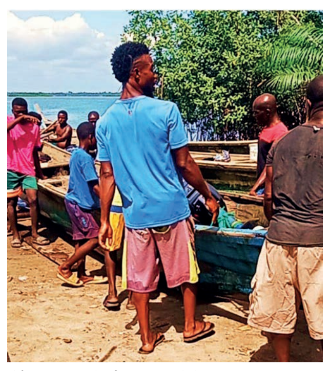
Fishermen preparing for a rescue mission