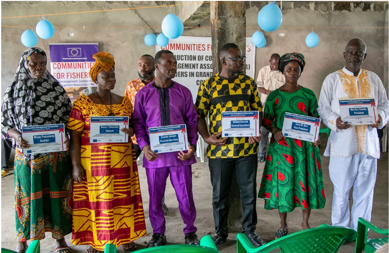
Region II CMA induction, Bomie, Grand Cape Mount County

In September 2023, EJF and NaFAA established three new CMAs for Regions I, II, and III and inducted six new officials (president, vice president, secretary, financial secretary, treasurer, and auditor) in all regions.