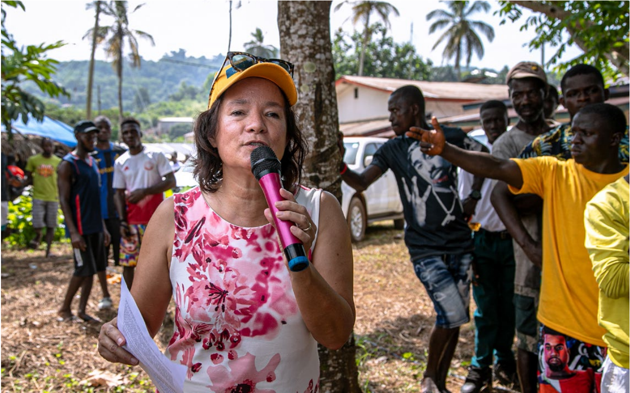
The EU Ambassador delivering speech at the EU-Liberia 50 year partnership event, Robertsport, Grand Cape Mount County