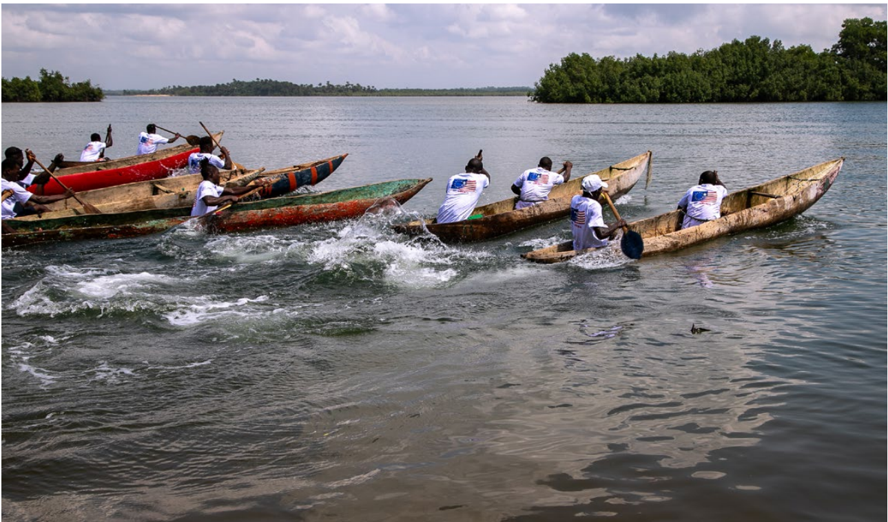
Fishers competing in the boat race, Robertsport, Grand Cape Mount County