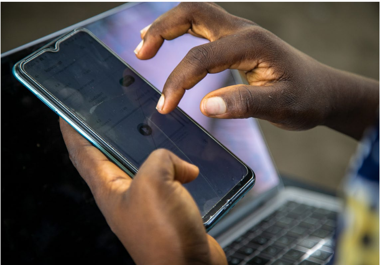
Dase app installation

Additionally, EJF Community Mobilisers continuously raised awareness in the communities of the importance of the DASE app and how it is used by fishers to report IUU fishing.