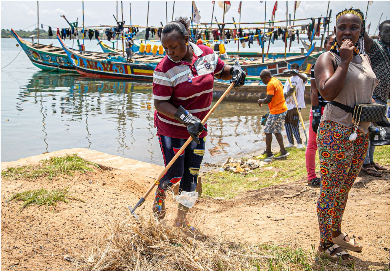
Community science beach cleaning activity, Robertsport, Grand Cape Mount County