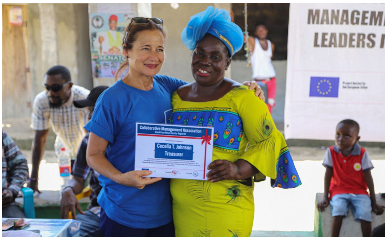
Presentation of certificate of induction to Region III CMA Treasurer, Tailor, Grand Cape Mount County