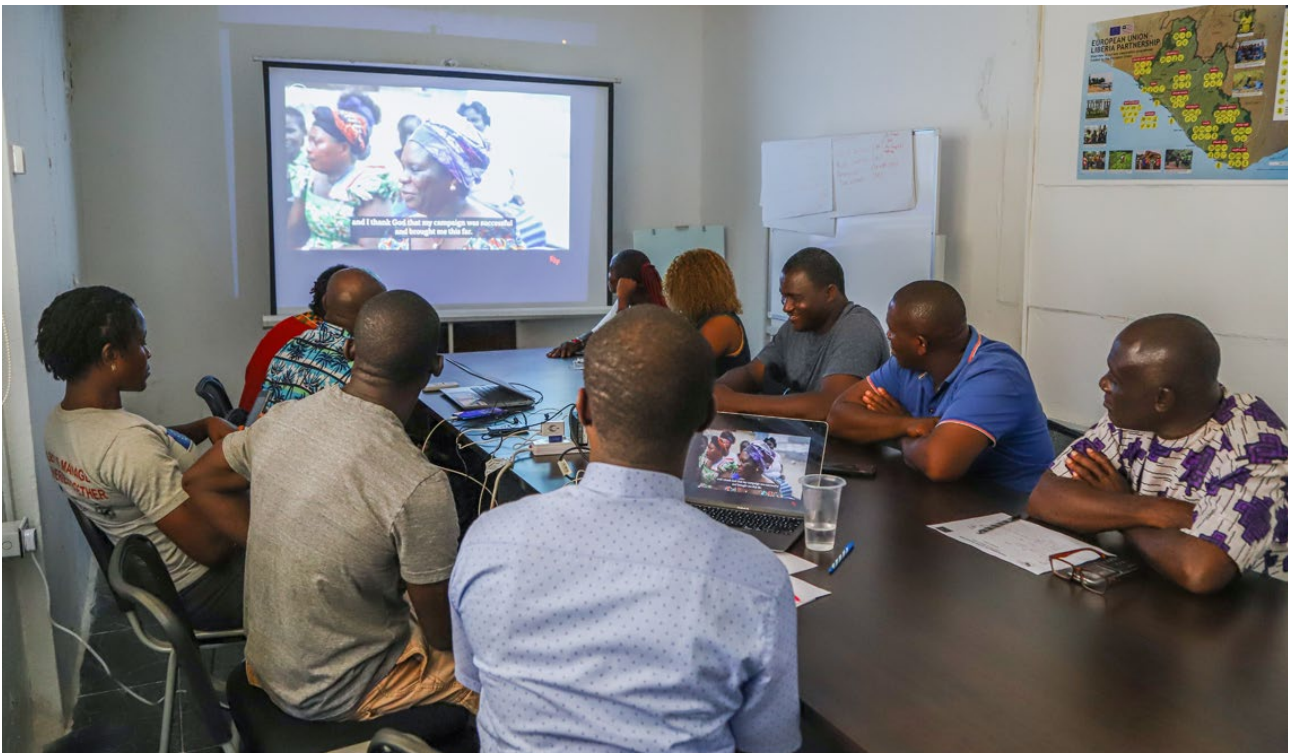
Film screening during engagement with LAFA, Monrovia, Montserrado County

In addition, EJF supported the Liberia Artisanal Fishers Association (LAFA) in reviewing and adopting its 2022 revised constitution, setting up interim leadership, and conducting leadership training. The project also hosted a consultative meeting with LAFA executives on the status of their ongoing advocacy to reduce licence fees on motorised boats and canoes and the development of LAFA's annual work plan.