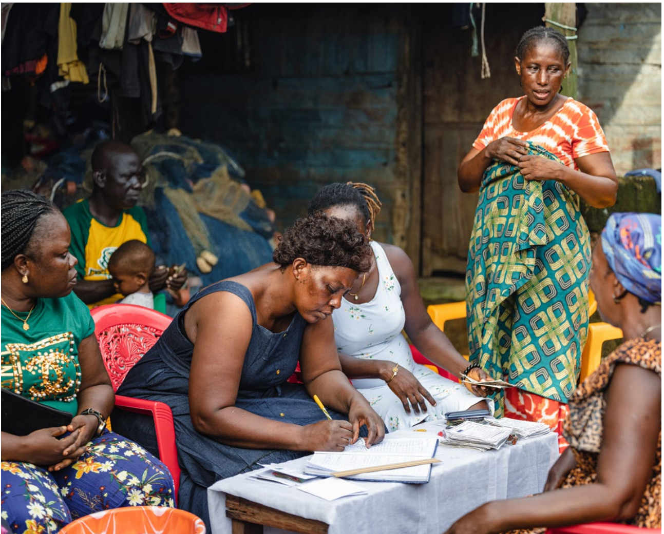
VSLA meeting, Buchanan, Grand Bassa County

In the second quarter of 2023, the VLSAs raised over US$95,000 from savings and loans given to members. This does not include the over US$100,000 raised during the first period of the year, from January to June 2023.