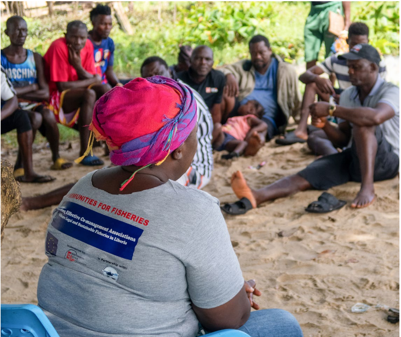
EJF staff creating awareness on CMA in Sowie, Grand Cape Mount County