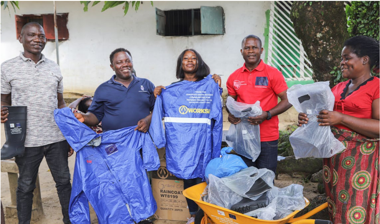
Presentation of community science material to CMA, Buchanan, Grand Bassa County