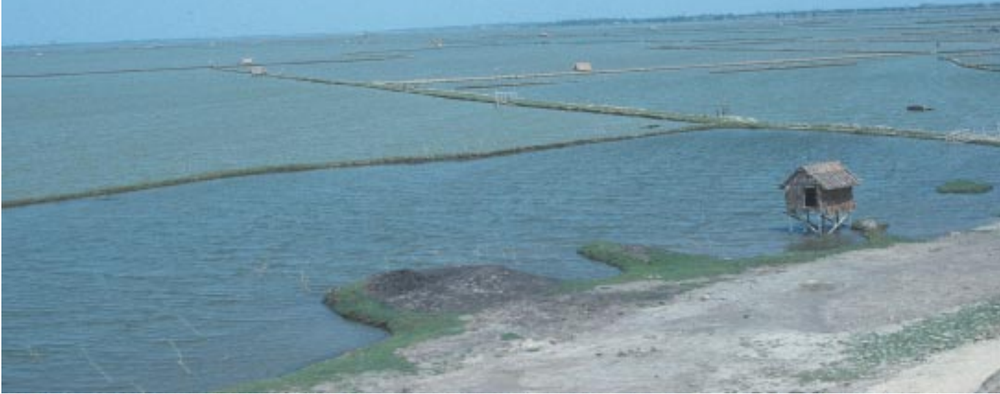
ABOVE: Shrimp ponds, Khulna.