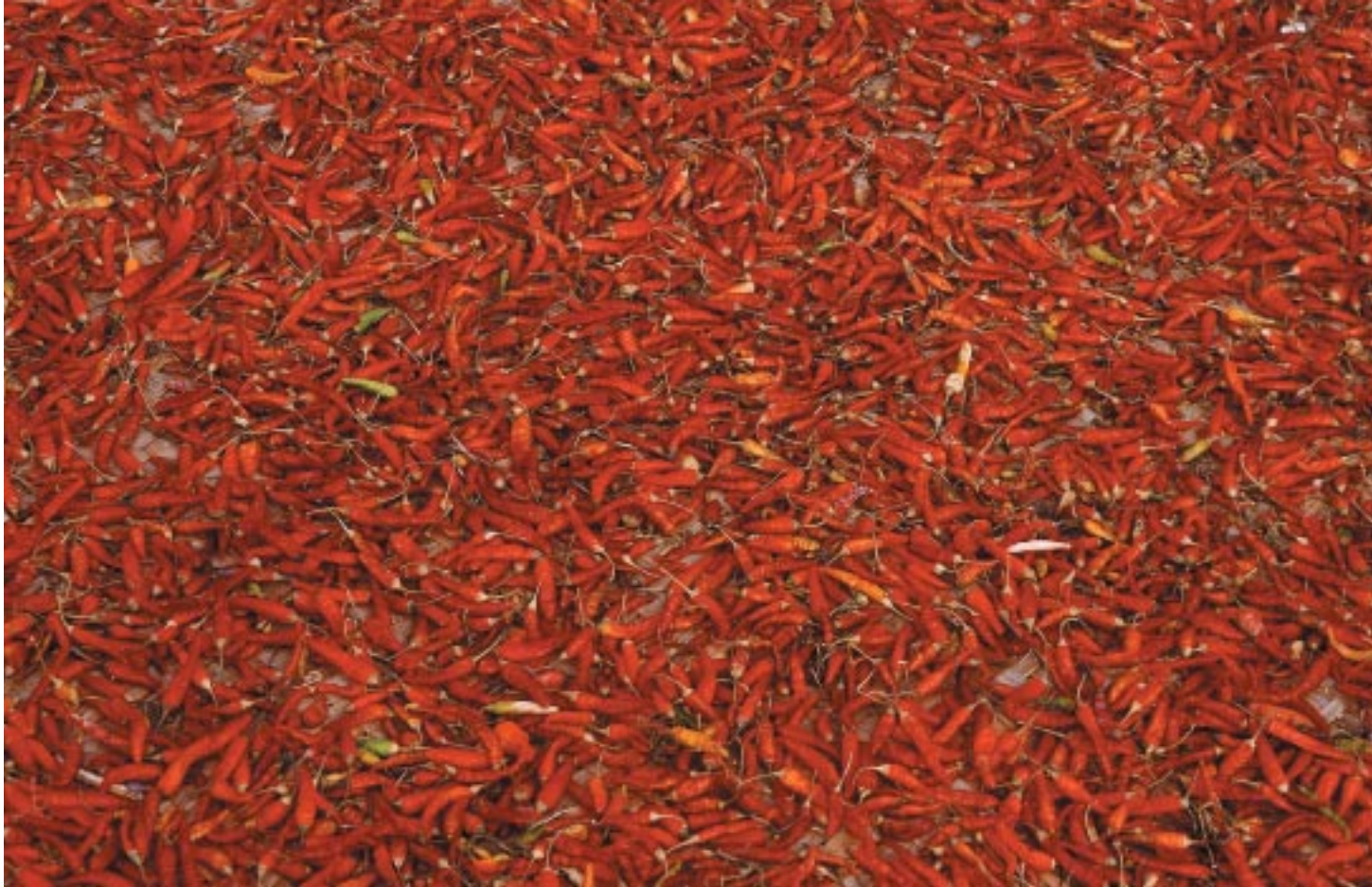
ABOVE: Chilli crops, Noakhali.