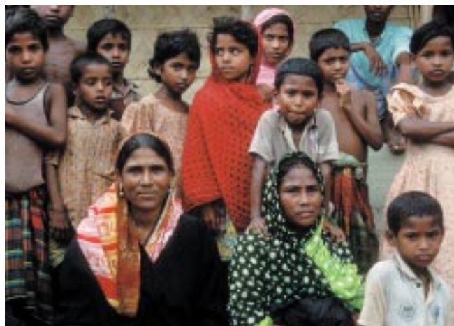
ABOVE: Members of a landless group, Noakhali.

The Water Development Board (BWDB – responsible for protecting crops from saline or floodwaters) 5 has been seemingly powerless to bring wrongdoers to justice: of the approximately 250 cases filed, all have been dismissed due to either a lack of witnesses or a failure to identify the perpetrator 10 . A recent report stated that 'the rich farmers control the water resources to a great extent by controlling the sluice gates in collaboration with the BWDB officials. Some of them have also constructed private sluice gates to control the water. The small gher owners are the victim of it' 13 .