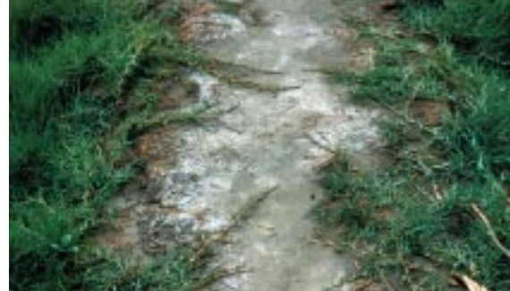
Salt crystals encrust surface of soil next to a shrimp pond.