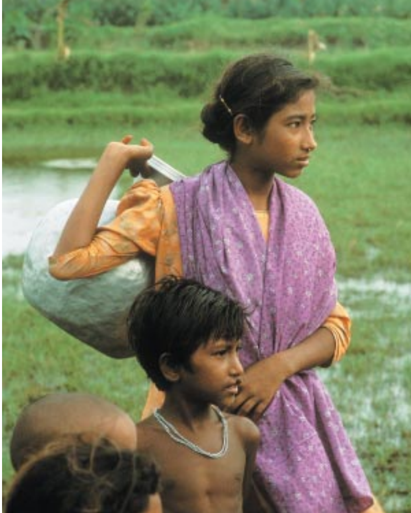
LEFT: Depletion and salinisation of freshwater supplies mean Bangladesh's women and children have to walk increasingly long distances to collect clean water.