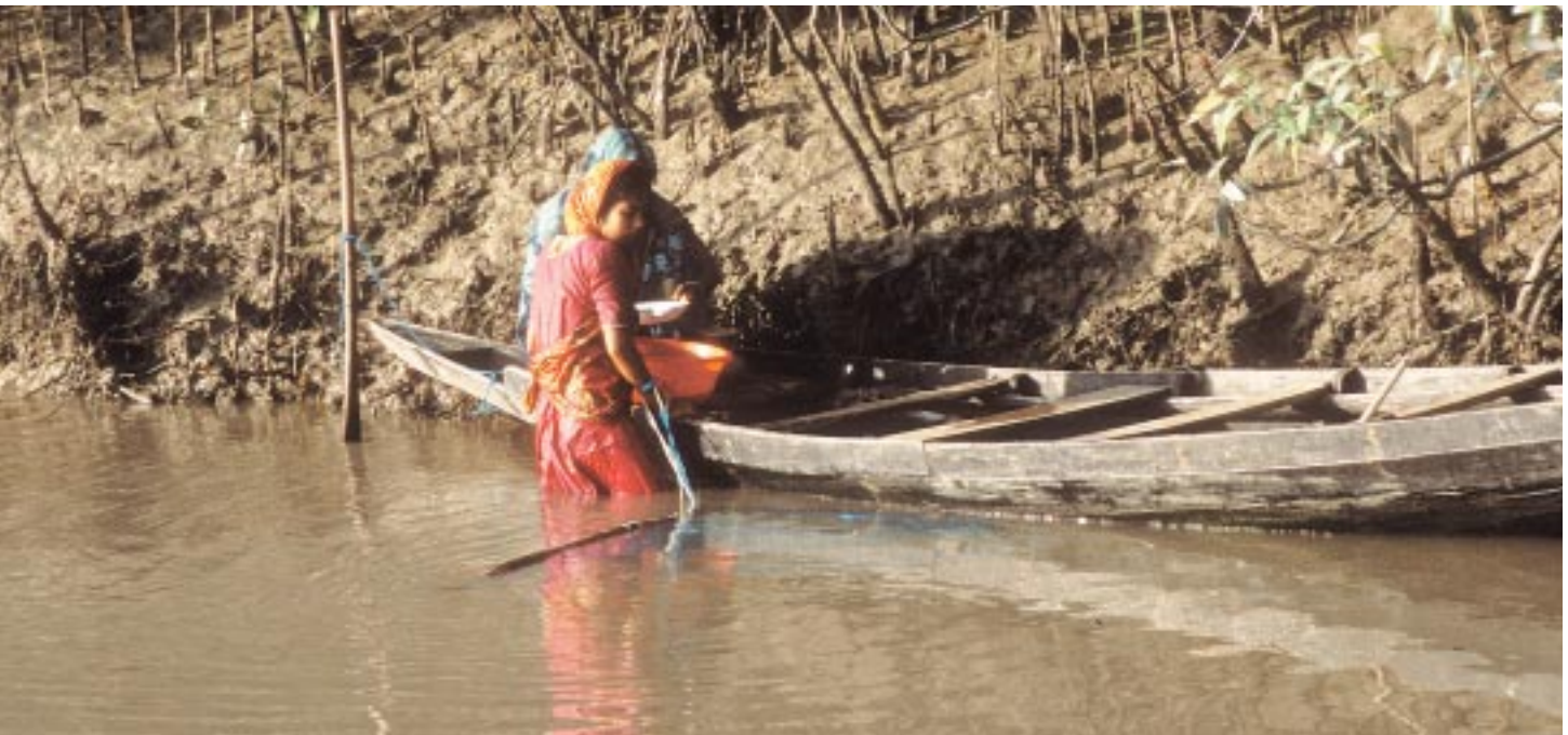
ABOVE: Fry collection in the Sundarbans. Most fry collectors are amongst the poorest, most vulnerable members of society