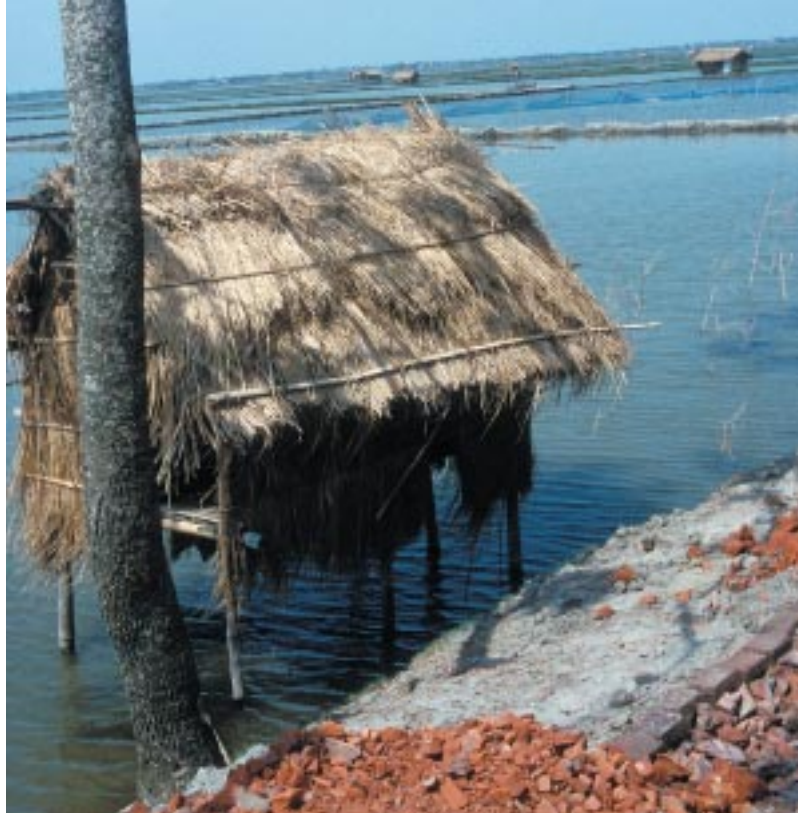
LEFT: Shrimp aquaculture has been associated with increased socio-economic differentiation and social instability.