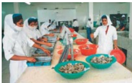
ABOVE: Shrimp processing factory – concerns over processing standards have led to bans on imports of Bangladeshi shrimp.