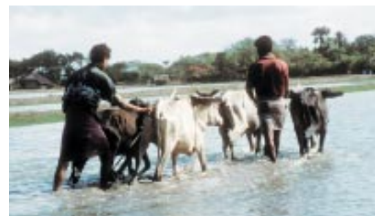
ABOVE: Thousands of Bangladeshi subsistence farmers have been affected by the loss of traditional agricultural opportunities.