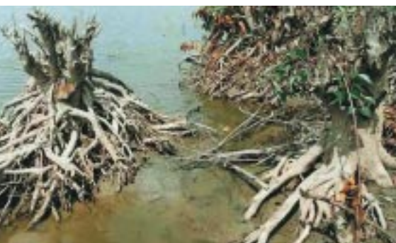
ABOVE: The remains of the Chokoria Sundarban – the forest has been almost completely destroyed by conversion to shrimp ponds.